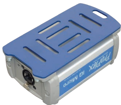
Includes Plate for attachment of Mounting Strap (included) and safety cable