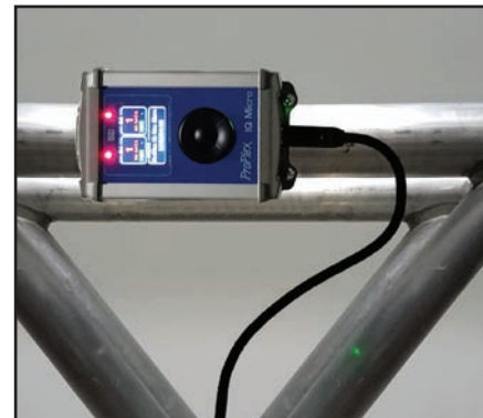
IQ Micro's easy-to-use mounting strap (included) fastens to truss and nearly anywhere else!