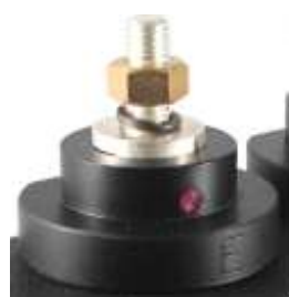
M12 Cable Lugs