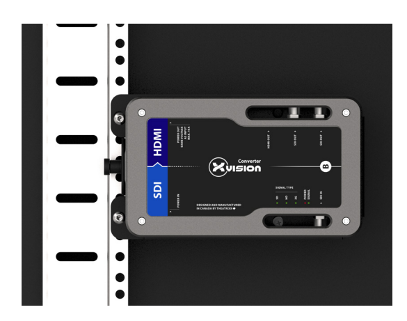
Mounted inside 19" rack