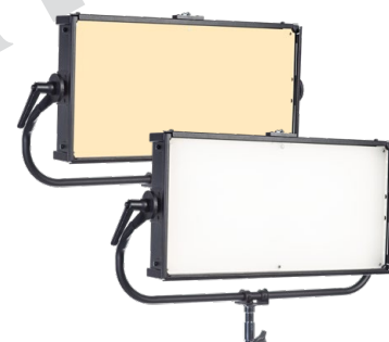
Space Force onebytwo™